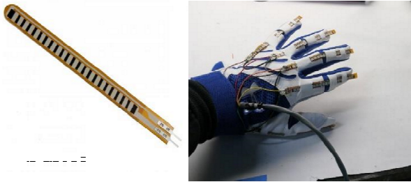
Fig 4: Flex Sensor & Glove

Spectra Symbol has used this technology in supplying Flex Sensors for the Nintendo Power Glove, the P5 gaming glove and also for several other applications.