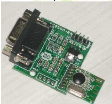
Fig 3: ZigBee Module