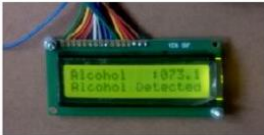
Figure 3 Alcohol detection

The figure 4 shows the automatic parking system