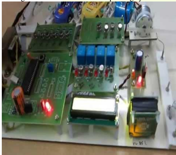
Figure 4 Automatic Car Parking system

The figure 4 shows the automatic parking system