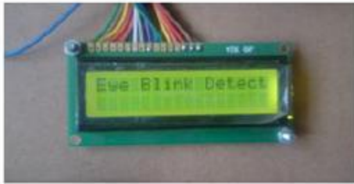
Figure 2 Eye blink detection