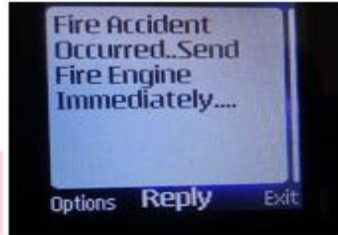
Fig 4 Fire Station Mobile Section