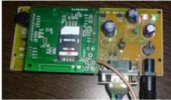
Fig 3.GSM Module