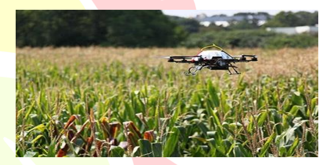
Fig (7) Using drowns to capture image

The data in the form of pictures can be captured through our smart phones can be sent to the bank. The Agricultural bank contains necessary tools to analyze the data and within a short period, the farmer gets the solution to his problem.