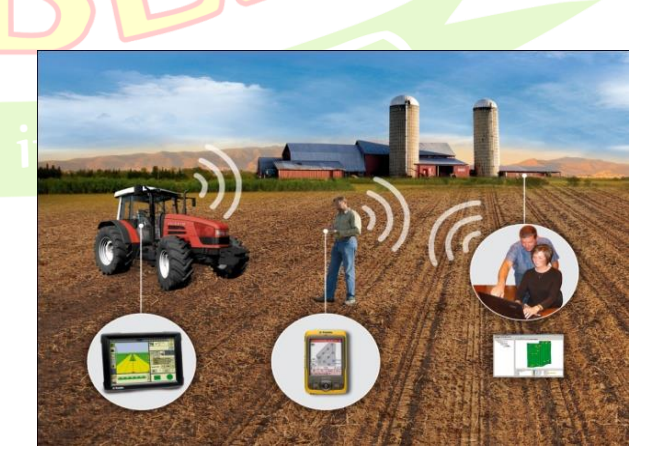
Fig (3) Sensor for climatic changes detection

Some of the applications below can be seen in a particular manner of collecting data