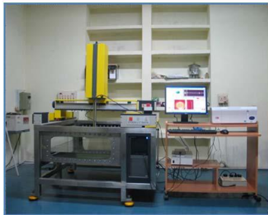
Figure 2: Ultrasonic C-Scan systems