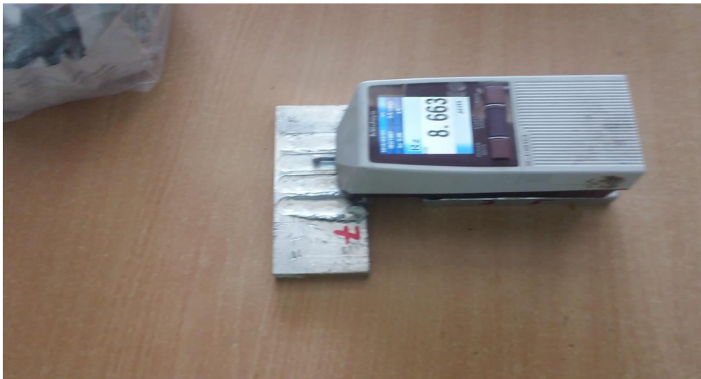
Fig 1 Surface roughness tester