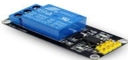
Fig 4: Relay

A relay is an electrically operated switch. Many relays use an electromagnet to mechanically operate a switch. Relays are used where it is necessary to control a circuit by a separate low-power signal, or where several circuits must be controlled by one signal.