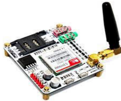
Fig 2: GSM Modem

When a GSM modem is connected to a computer, this allows the computer to use the GSM modem to communicate over the mobile network. While these GSM modems are most frequently used to provide mobile internet connectivity, many of them can also be used for sending and receiving SMS