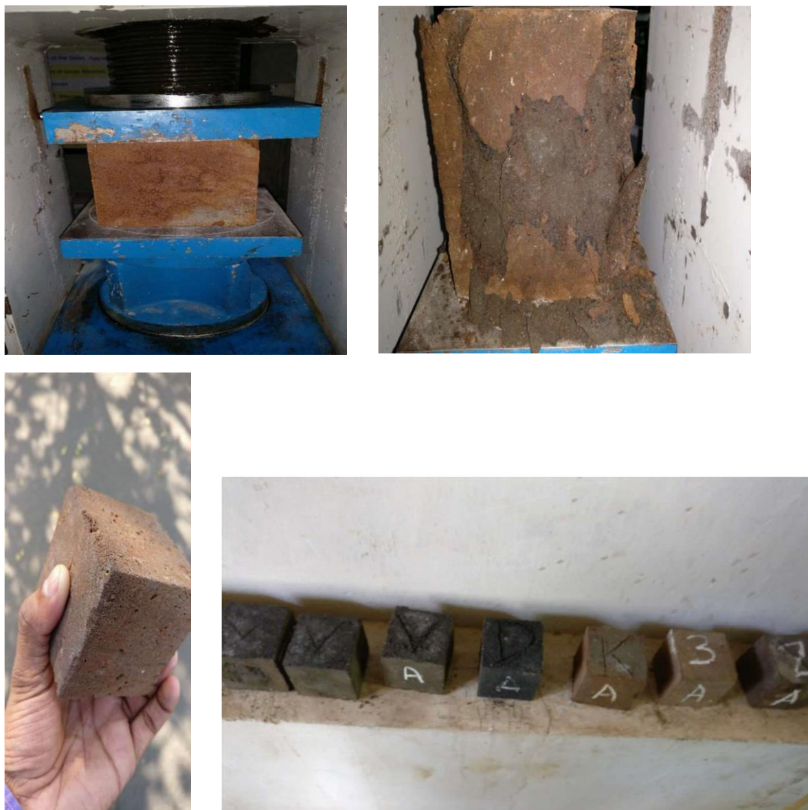
Fig. Cubes tested.