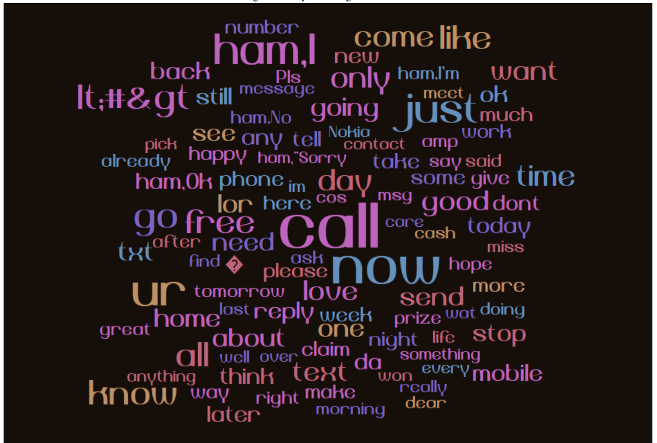
Fig 3. Wordcloud